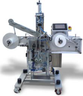
Vertical Mode with Vertical Filling

One PakPoucher ™ can be run either as a horizontal or a vertical packaging machine, allowing for optimal product delivery into the package.