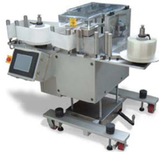
Horizontal Mode with Vertical Filling