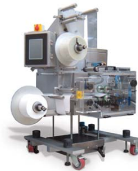
Horizontal Mode with Horizontal Filling Product loading area can be extended as required.

The PakPoucher ™ can create pouches using a wide variety of packaging materials, and fill them with a diverse array of products, including: